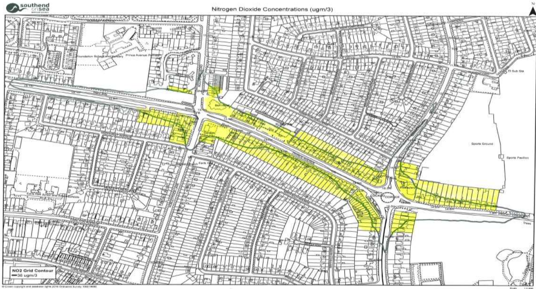
Figure 3. The A127 Bell Junction AQMA: Boundary in Green; Properties Affected in Yellow